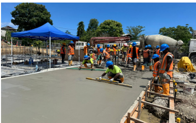
Concrete slab and foundation works at the Naha Birthing and Urban Health Centre.

The Naha Birthing and Urban Health Centre is a SBD250 million investment in the health of Solomon Islanders, funded by Australia in partnership with the Ministry of Health and Medical Services, and implemented by the Solomon Islands Infrastructure Program with local subcontractors and workers.